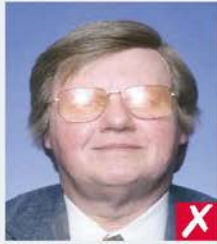
flash reflection on lenses