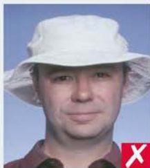
wearing a hat