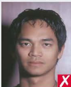
shadows behind head