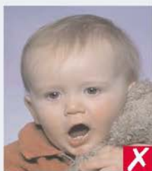
mouth open and toy too close to face