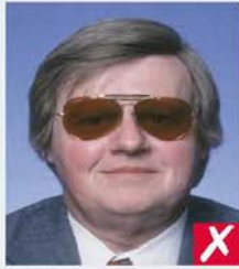
dark tinted lenses