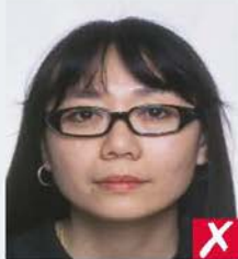
frames too heavy