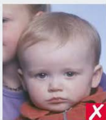
shows another person