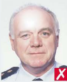
flash reflection on skin