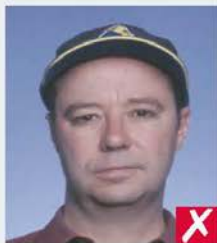
wearing a cap